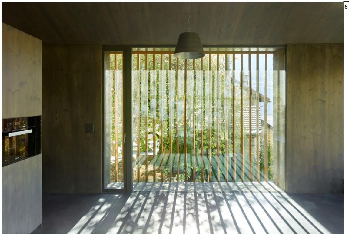
Fig. 8 Bedroom.