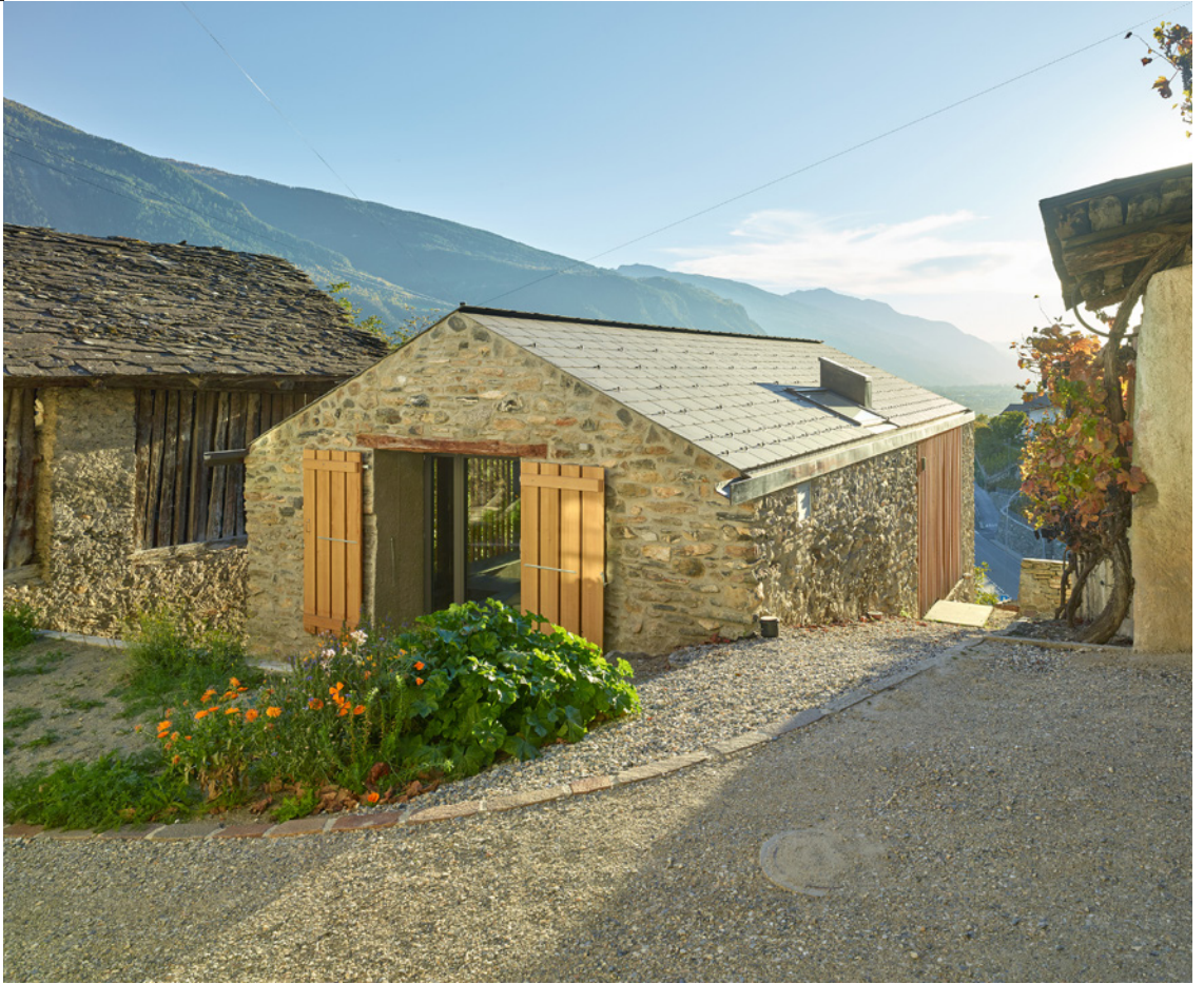
Fig. 1 First floor plan.